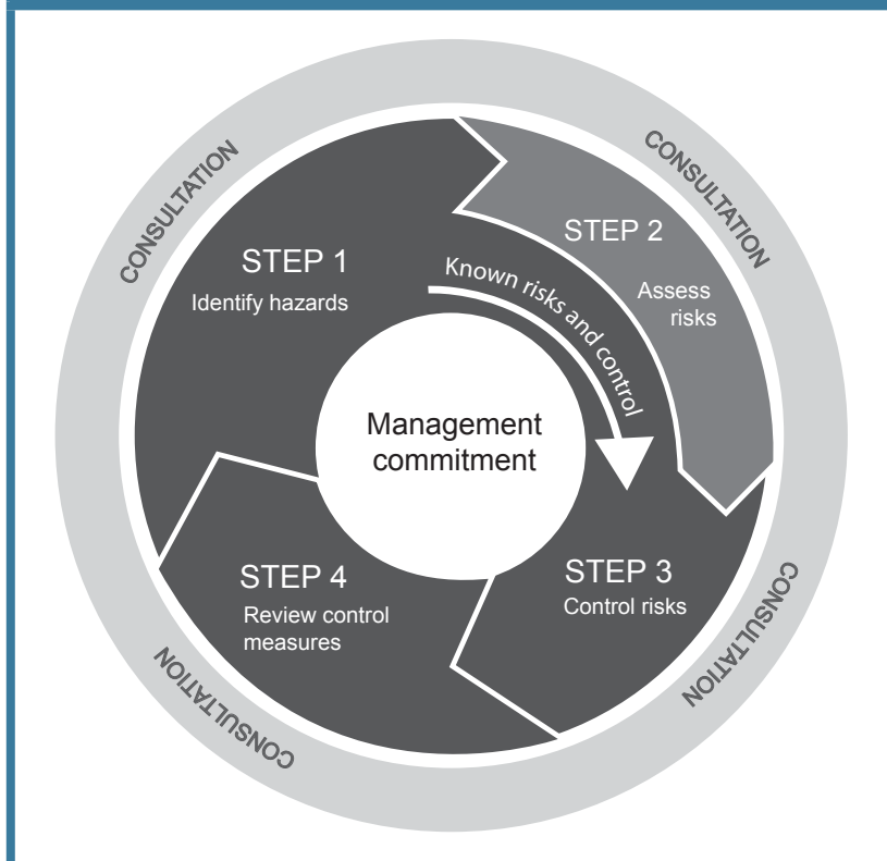
FIGURE 1: The risk management process

Many hazards and their associated risks are well known and have well established and accepted control measures. In these situations, the second step to formally assess the risk is unnecessary. If, after identifying a hazard, you already know the risk and how to control it effectively, you may simply implement the controls.